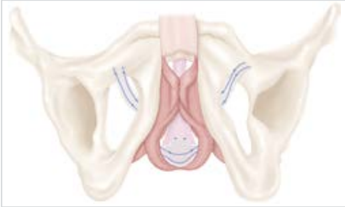
The sling is placed flat along the corpus spongiosum